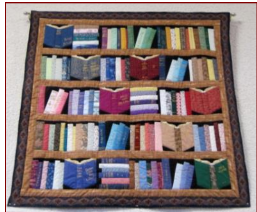
Reading Room quilt stitched by a patron who donated her creation to the Willits Public Library

grams. Members visited all county branches, spoke at public meetings, recorded messages for community television and gathered support at tables set up at post offices and grocery stores. Included in results of the Consolidated District Election November 8, 2011: Measure A (library sales tax) received 75.66 per cent of the vote.