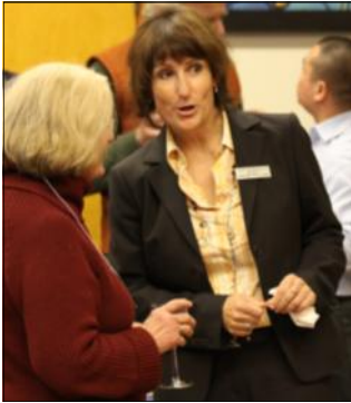
Superior Court Judge Ann Moorman at 2010 Meet and Greet reception in Fort Bragg.